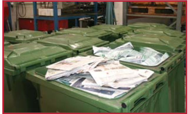
Photo above: Recycling paper is one of the many ways Oahu Transit Services, Inc. helps preserve the environment.

We recover all our vehicle fluids to the point that we purchased an oil can crusher that so that we can squeeze all the oil out of the can. The can itself is recycled as are all types of metal waste, (since Jan '08 we have collected over $12,000 for recycled metals). Even the transfers that we pass out to our passengers are printed on recycled paper which doesn't seem like much until you learn that we purchase over 37 million transfers in a year.