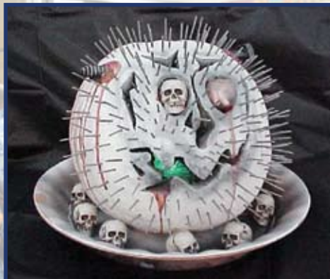
Photo Above: The ugliest pumpkin by Paul Bringas , Paratransit Operator