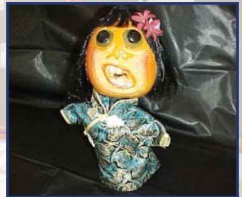
Photo Above: The most creative pumpkin by Kealii Bartrand , Customer Service Supervisor