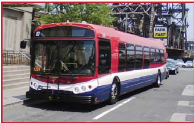
Photo Above: The CompoBus that will be used for testing during the month of February at both the Kalihi-Palama and Pearl City Divisions.

The extra five feet over our standard 40-foot models allows the CompoBus to carry more seated and standee passengers. Although the demonstration model seats 46 passengers, future builds will seat 48. The CompoBus can seat more passengers than any of our 40-foot buses.