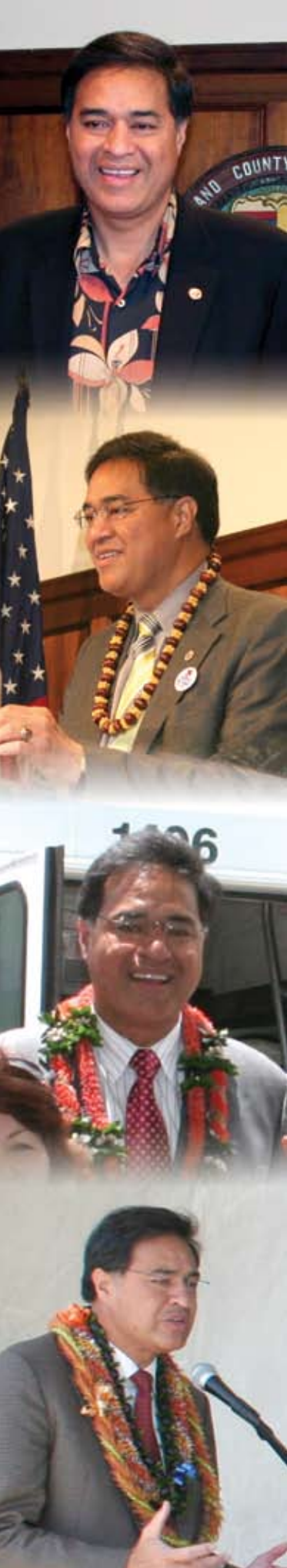
MUFI HANNEMANN MAYOR

OFFICE OF THE MAYOR CITY AND COUNTY OF HONOLULU 530 SOUTH KING STREET, ROOM 300 • HONOLULU, HAWAII 96813 PHONE: (808) 523-4141 • FAX: (808) 527-5552 • E-MAIL: mayor@honolulu.gov