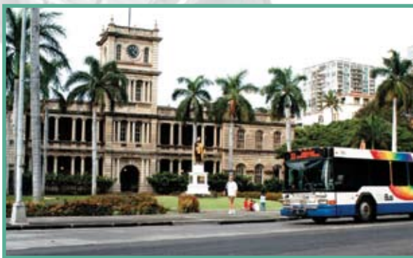
Photo Above: Second Place Photo by Transportation Clerk II Rudi Ocampo.