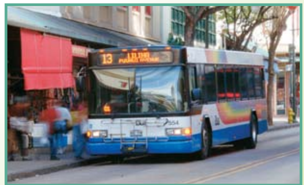
Photo Above: Third Place Photo by HEM - Transmission Shop Jeff Mitsuda.