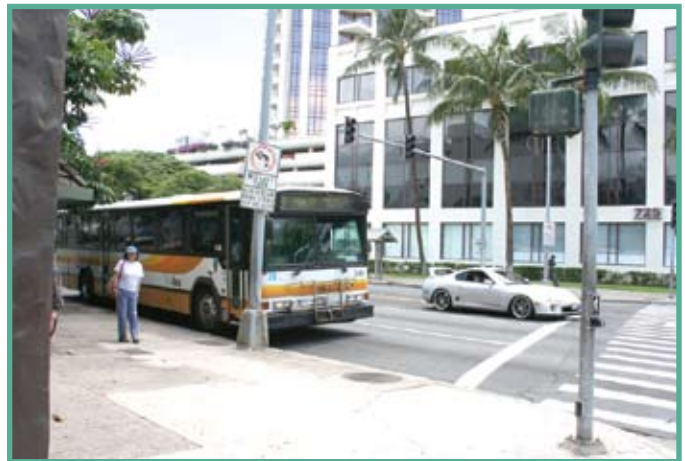
Photo Above: Running red light complaints are second only to unsafe merging complaints. Red-light running is often the result of aggressive driving and is completely preventable.