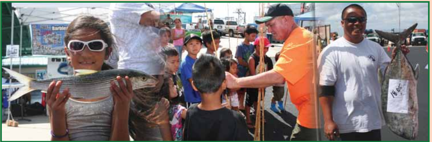
Photo above: The 3rd Annual OTS Family & Friends Fishing Tournament was held the weekend of October 19-21, 2012. Over 80 contestants registered, hoping to reel in the “big one” and own “bragging rights.” The weigh-in was held at Pier 38’s parking lot between POP Fishing & Marine and Uncle’s Fish Market & Grill. It was a fun-filled day of food, entertainment, and lots of prizes! Thank you to all the sponsors and volunteers who made this event a success!