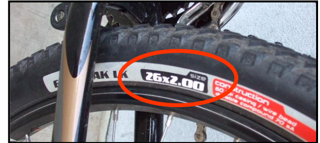
Examples: 26" Wheel Diameter & 2" Tire Width

1. How to find the Wheel Base . Measure the distance between the front and rear axles.