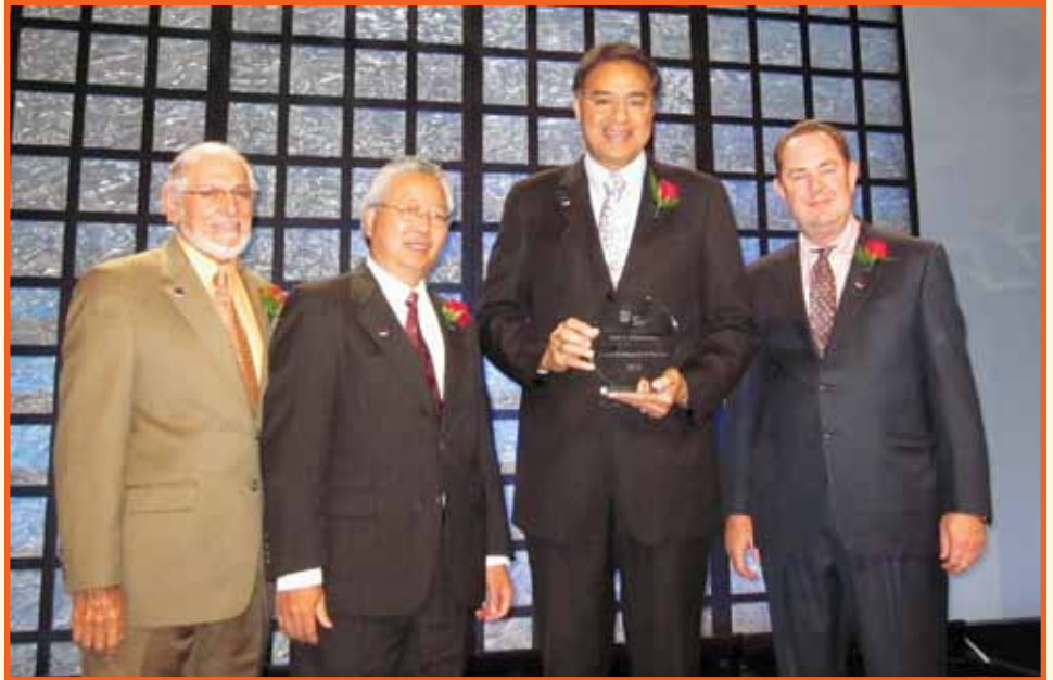
Photo right: (left to right):