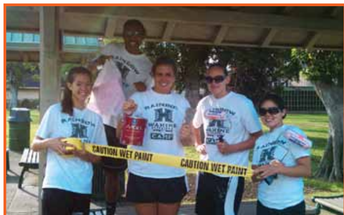
Photo above: UH Wahine Basketball team members clean shelters at Sinclair Circle.