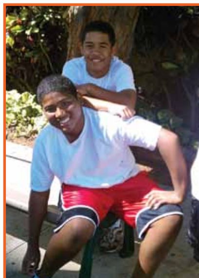
Photo above: Iolani 8th graders cleaning the neighborhood.