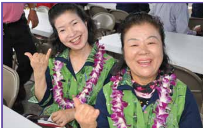
Photo above: Two members of the study tour learn to do the "Shaka."