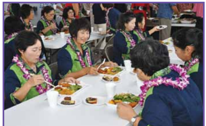
Photo above: The women enjoying a luncheon after the facility tour.