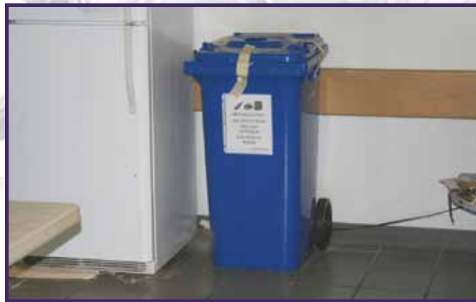
Photo above: There is a collection bin in the Operators' lounge at the Kalihi-Palama Facility.