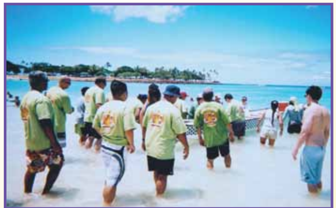
Photo above: The Team takes out the dragon boat into water at Ala Moana Beach Park.