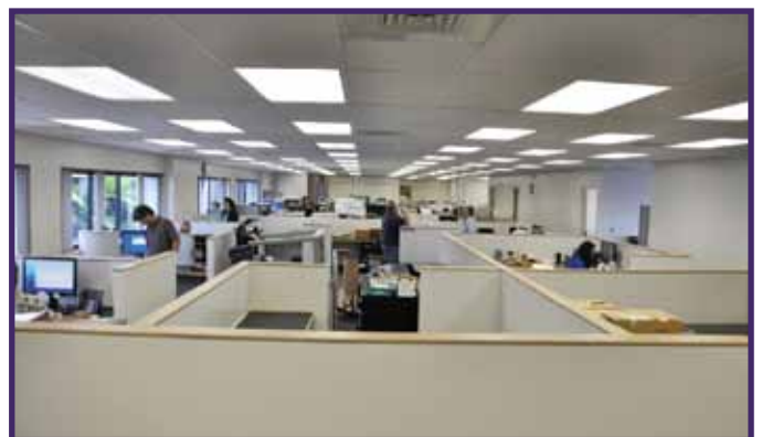
Photo above: September 23, 2011, the finished Operational Planning and Scheduling Department sections.