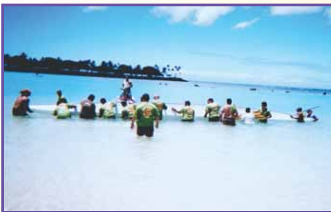
Photo above: Oops! Keeping the dragon boat upright is a bit harder than expected.