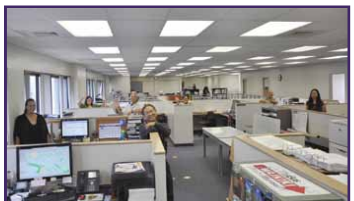
Photo above: October 6, 2011, The Scheduling and Operational Planning Staff getting comfortable in their new area.