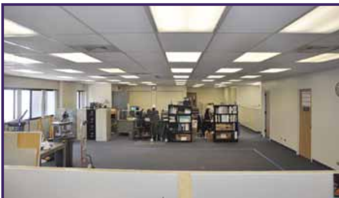
Photo above: September 26, 2011, The Maintenance and Data Analysis Departments are next to be fabricated.