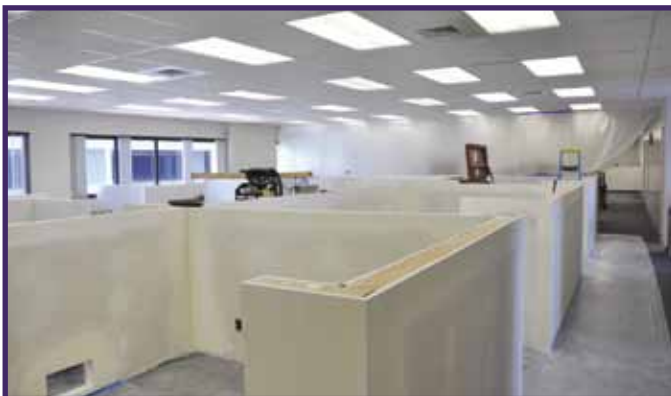
Photo above: August 12, 2011, the new partitions of the Operational Planning and Scheduling Departments being erected and painted.