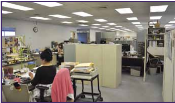
Photo above: June 14, 2010, the administration offices before the renovations started.