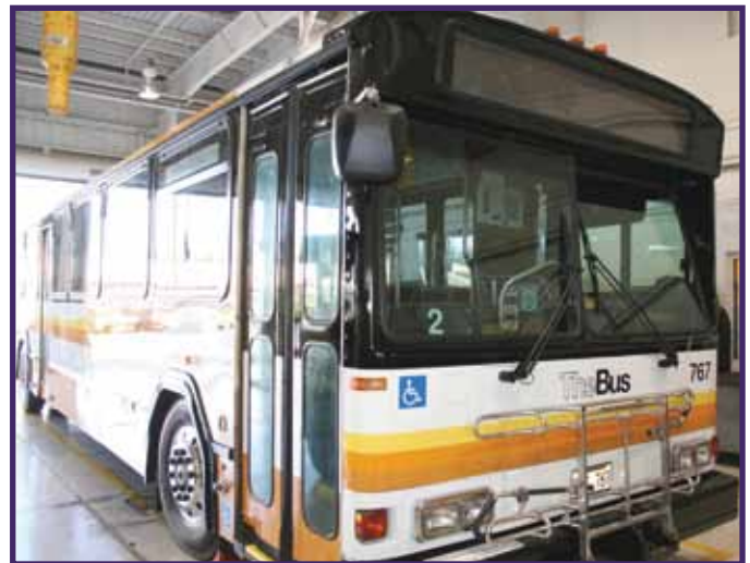
Photo above: With the introduction of new aerodynamic designed buses, the old blocky Gillig buses will be a thing of the past.

Looking to the future, I believe it’s safe to assume the transportation industry will witness the evolution of transit bus manufacturing with an emphasis on lighter, more aerodynamic vehicles. Reducing the overall vehicle weight and wind drag coefficient equals a net benefit of less energy required to accomplish the task of payload transport. Hey, didn’t General Motors already incorporate these same design concepts into the manufacturing of the Chevy Corvette? Just envision how cool it will be for OTS bus operators to pilot a new, sleek, aerodynamic bus through Kalakaua Avenue. It’s coming folks, and we’re all invited for the ride.