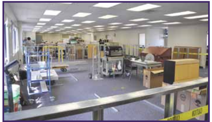
Photo above: June 15, 2011, the Scheduling Department was relocated as Plant Maintenance started clearing room for the fabrication of the new partitions.