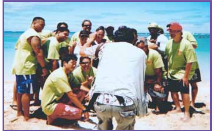
Photo above: DTS and OTS employees pose for the Star Advertiser Photographer.

Be on the lookout for dragon boat race redemption next year!