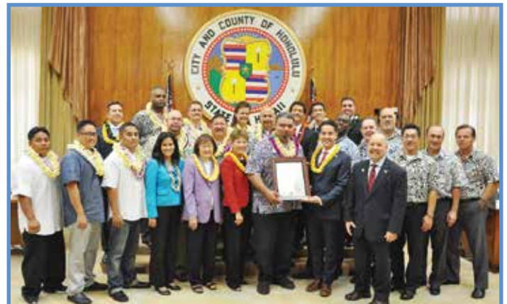
Photo above: OTS Roadeo winners honored by the Honolulu City Council.