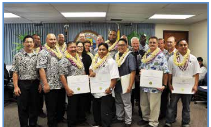
Photo above: OTS Roadeo winners honored by the Mayor of Honolulu Kirk Caldwell.