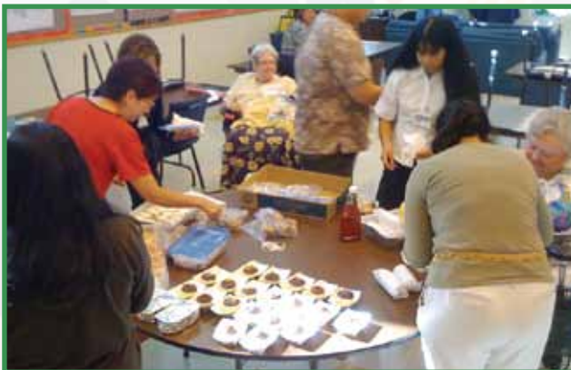
Photo Above: Paratransit Staff preparing baked goods for their bake sale.